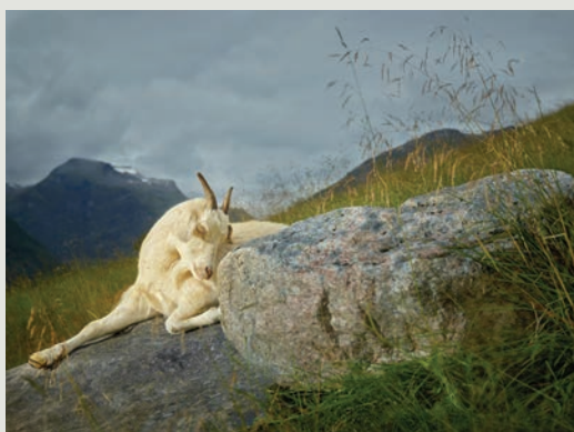
Hazel, Geiranger Fjord, Norway (2013)

Kern's evocation of nature as a device to understand his own sense of self draws upon historical precedence: the use of animals as metaphor and the pastoral tradition. Yet the artist's broad concept — his exploration of identity — is firmly grounded in a contemporary context. This tightly knit series of images, which together characterize the author, is common to our age of social media. Kern's aesthetic, however, emphasizes clarity and projects a warm stillness that is a balm to an overstimulated society. This contrast too — the ties to digital media and the rejection of its characteristics — deepens this pastoral project. Yes, it is a photograph of a goat, but it is also more than that. Just as man's relationship with the animal world is multifaceted, so too is Kern's work.