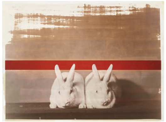
Supreme Champion Rabbit Matching Male/Female Pair Salt over pigment print, 20 x 24 inches (2019)

Salt prints, a photographic process popular between 1839–1860, connect to photography's historical roots; printing on them digitally connects to the present. Combining these two printing processes softens photography's particularized quality. The subtle tones of salt printing express mood and emotion, a contrast to the sharpness of a digital print. Subject, process, emotion, science, and chance combine to make both an immediate document and a comment on photography's past, present, and future.