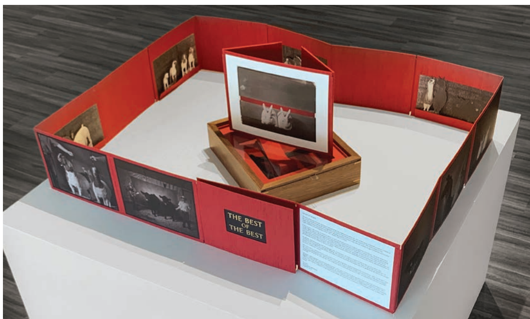
The Collector's Edition of The Best of the Best , Installation View, Burnet Fine Art & Advisory

ANJULI J. LEBOWITZ | Department of Photography National Gallery of Art | Washington, D.C.