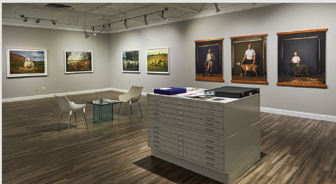
Solo Exhibition, Burnet Fine Art & Advisory, Wayzata, Minnesota (2018)