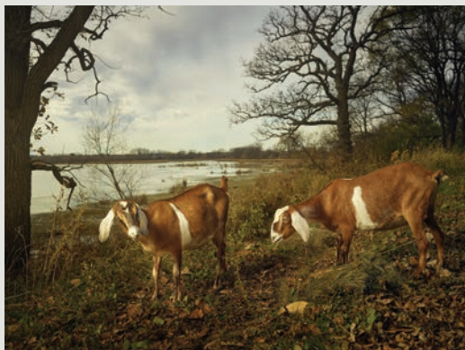
Dumb and Dumber Freeborn County, Minnesota, USA (2016)