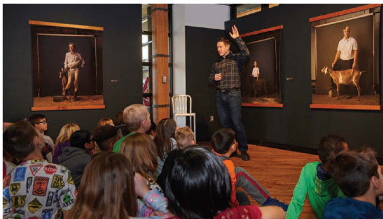
The Unchosen Ones , Solo Exhibition, Plains Art Museum, Fargo, North Dakota (2019-2020)

SELECTED COLLECTIONS holding his work include: Center for Creative Photography (Tucson, AZ), Center for Photography at Woodstock (Woodstock, NY), Fidelity Corporate Art Collection (Boston, MA), Griffin Museum of Photography (Winchester, MA), Leepa-Rattner Museum of Art (Tarpon Springs, FL), General Mills Corporate Collection (Minneapolis, MN), Minneapolis Institute of Art (Minneapolis, MN), Plains Art Museum (Fargo, ND), Masur Museum of Art (Monroe, LA), Minnesota Historical Society (St. Paul, MN), Museum of Fine Arts (Houston, TX), and Museum of Fine Arts (St. Petersburg, FL).