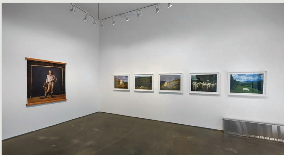
Solo Exhibition, Klompching Gallery, Brooklyn, New York (2018)