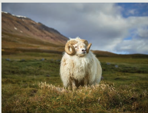
Mr. Hofsós, Skagafjardarsýsla, Iceland (2014)