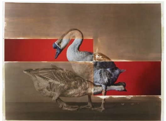
Supreme Champion Goose Male/Female Pair Salt over pigment print, 20 x 24 inches (2019)