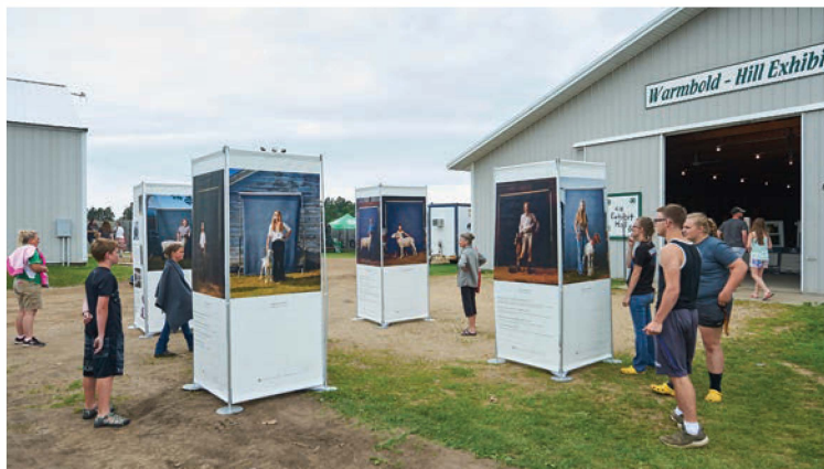
The Unchosen Ones , A Community Exhibition of Photography, Hubbard County Fair, Minnesota (2018)