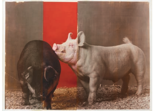
Supreme Champion Swine Male/Female Pair Salt over pigment print, 20 x 24 inches (2019)