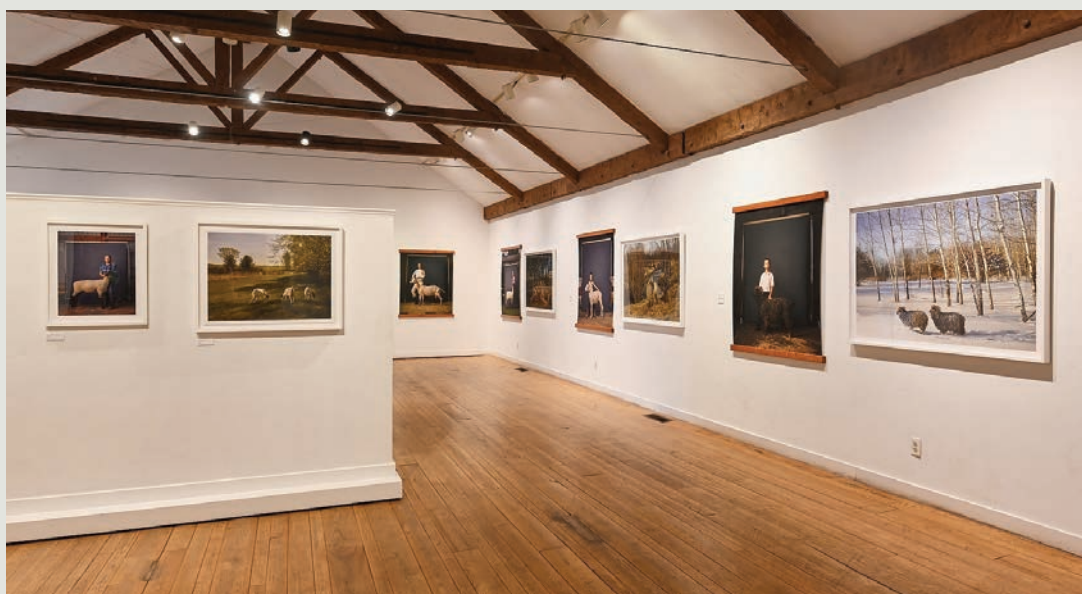
Solo Exhibition, Griffin Museum of Photography, Winchester, Massachusetts (2018)