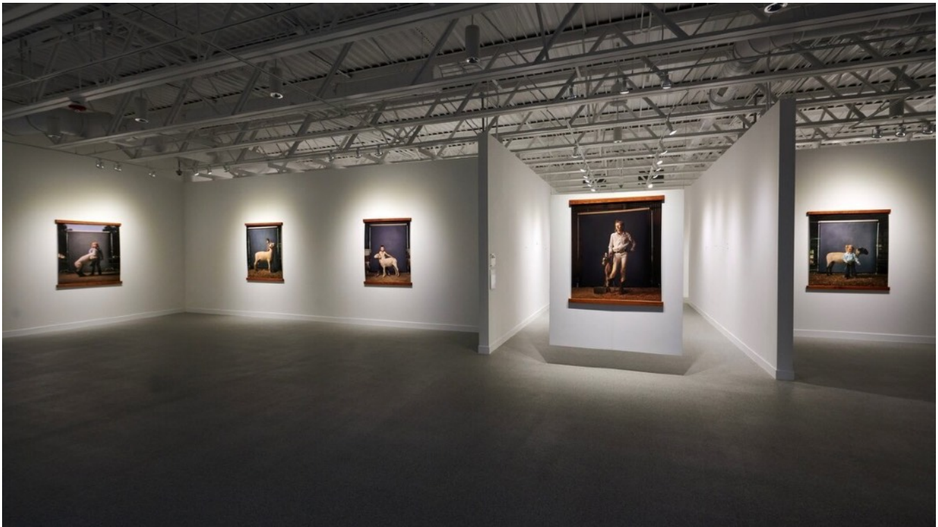
The Unchosen Ones exhibition, installation view, Watermark Art Center, Bemidji, MN, 2020