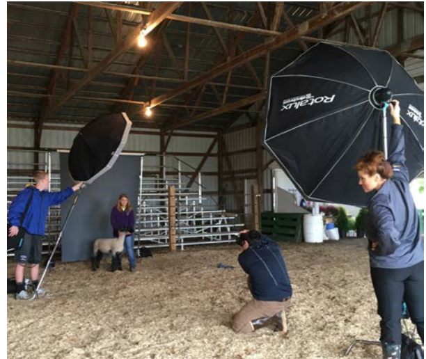
Behind-the-scenes at Clay County Fair, 2016

The Unchosen Ones project was published in National Geographic magazine (November 2017). The project was awarded CENTER’s Curator’s Choice Award (First Place) by juror Corey Keller, Curator of Photography, SF Museum of Modern Art. The work has been exhibited internationally including the National Portrait Gallery (London, UK), the Griffin Museum of Photography (Boston, USA), the Yixian International Photography Festival (Anhui, China), and the Rokko Photographic Garden (Kobe, Japan). The book, The Unchosen Ones , featuring over 65 participants from the project was published in 2018. The project was supported by the Minnesota State Arts Board Artist Initiative Grants (2016, 2018).