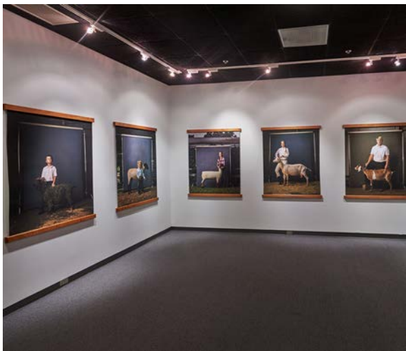
Gallery solo exhibition at Central Lakes College in Brainerd, Minnesota.

“No matter what place or award is received, the bond between the exhibitor and their animal is hard to break. The time spent feeding, training, watering, and grooming, along with the discipline to exercise and train their animal to hold its head high or to place its feet, hoping to catch the judge’s eye and win the highest approval. To many of these children, the animals become a friend or a pet. The exhibitors will carry the life skills and memories for a lifetime.”