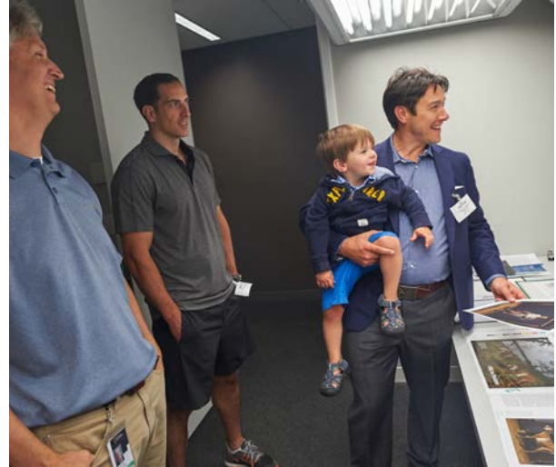
Pre-press meeting at National Geographic headquarters, Washington DC.