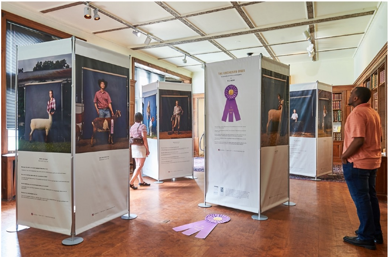
Hennepin History Museum, Minneapolis, MN, 2018 (above)

Email rj@rjkern.com or call the artist directly for details: (303) 474-0983.