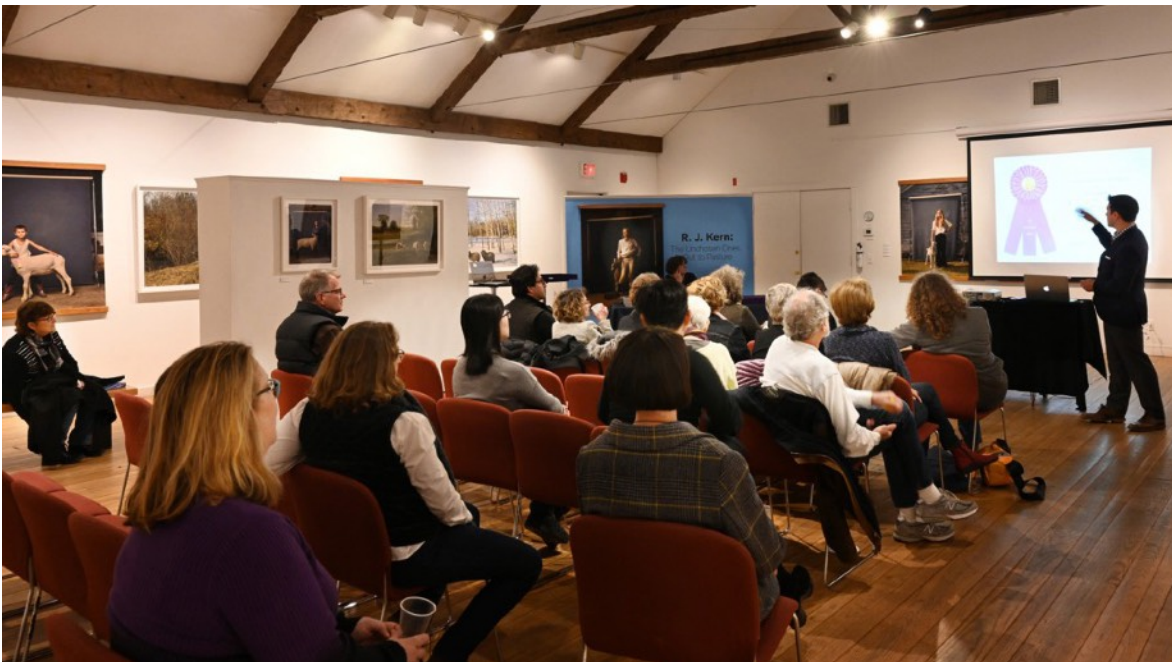
Artist Talk at the Griffin Museum of Photography, Winchester, MA