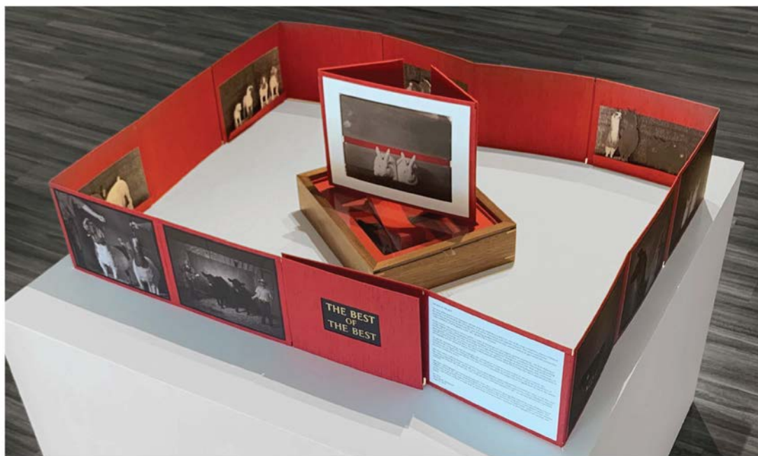
The Collector's Edition of The Best of the Best , Installation View, Burnet Fine Art & Advisory