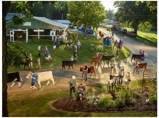
Live Action Role Players, Blue Earth County Fair (2022)

Inspired by the Dutch painter Pieter Bruegel and the American folk artist Grandma Moses, I employ a large format camera with studio lighting and a high angle of view to showcase the current realities and agrarian practices on display at the remaining country fairs. By embracing the constraints of “in-camera photography,” I intend to show the social and economic spectrum of rural communities, and to raise awareness for the changing face of American pastoral life.