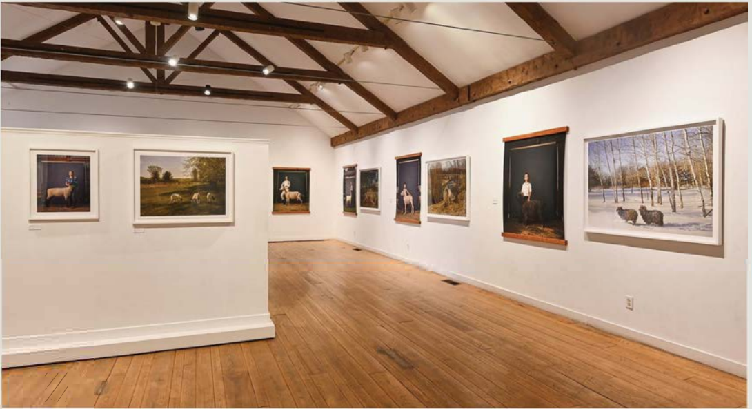
Solo Exhibition, Griffin Museum of Photography, Winchester, Massachusetts (2018)