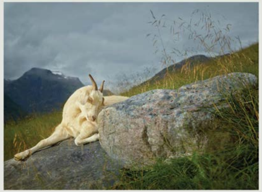
Hazel, Geiranger Fjord, Norway (2013)

Kern's evocation of nature as a device to understand his own sense of self draws upon historical precedence: the use of animals as metaphor and the pastoral tradition. Yet the artist's broad concept — his exploration of identity — is firmly grounded in a contemporary context. This tightly knit series of images, which together characterize the author, is common to our age of social media. Kern's aesthetic, however, emphasizes clarity and projects a warm stillness that is a balm to an overstimulated society. This contrast too — the ties to digital media and the rejection of its characteristics — deepens this pastoral project. Yes, it is a photograph of a goat, but it is also more than that. Just as man's relationship with the animal world is multifaceted, so too is Kern's work.