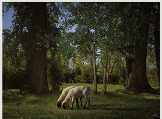
Nelly and Mate, Clay County, Minnesota, USA (2016)