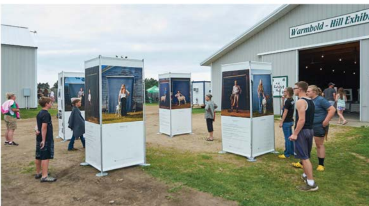
The Unchosen Ones , A Community Exhibition of Photography, Hubbard County Fair, Minnesota (2018)