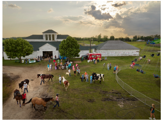
Opichi Drum Corps, Mahnomon County Fair (2023)