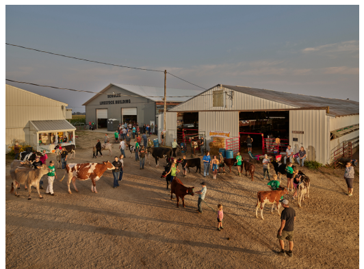
Houston County Fair, Minnesota (2023)