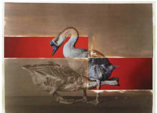
Supreme Champion Goose Male/Female Pair Salt over pigment print, 20 x 24 inches (2019)