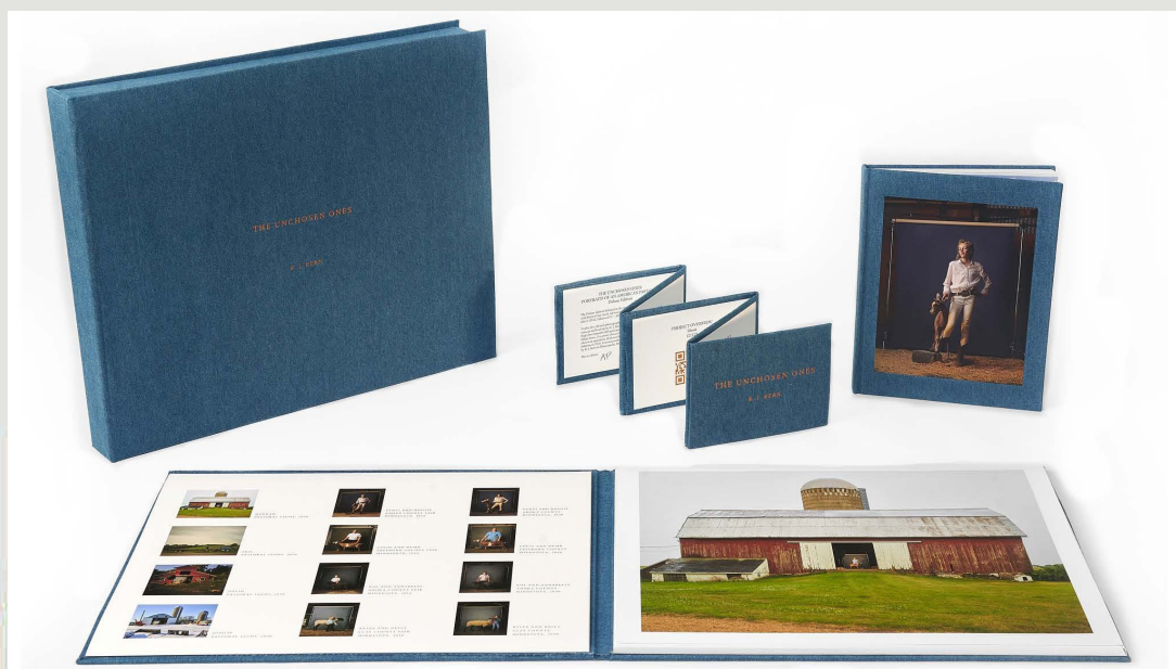
The Unchosen Ones: Deluxe Edition Portfolio (16 x20 inches, Edition of 12)