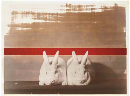
Supreme Champion Rabbit Matching Male/Female Pair Salt over pigment print, 20 x 24 inches (2019)

Salt prints, a photographic process popular between 1839–1860, connect to photography's historical roots; printing on them digitally connects to the present. Combining these two printing processes softens photography's particularized quality. The subtle tones of salt printing express mood and emotion, a contrast to the sharpness of a digital print. Subject, process, emotion, science, and chance combine to make both an immediate document and a comment on photography's past, present, and future.