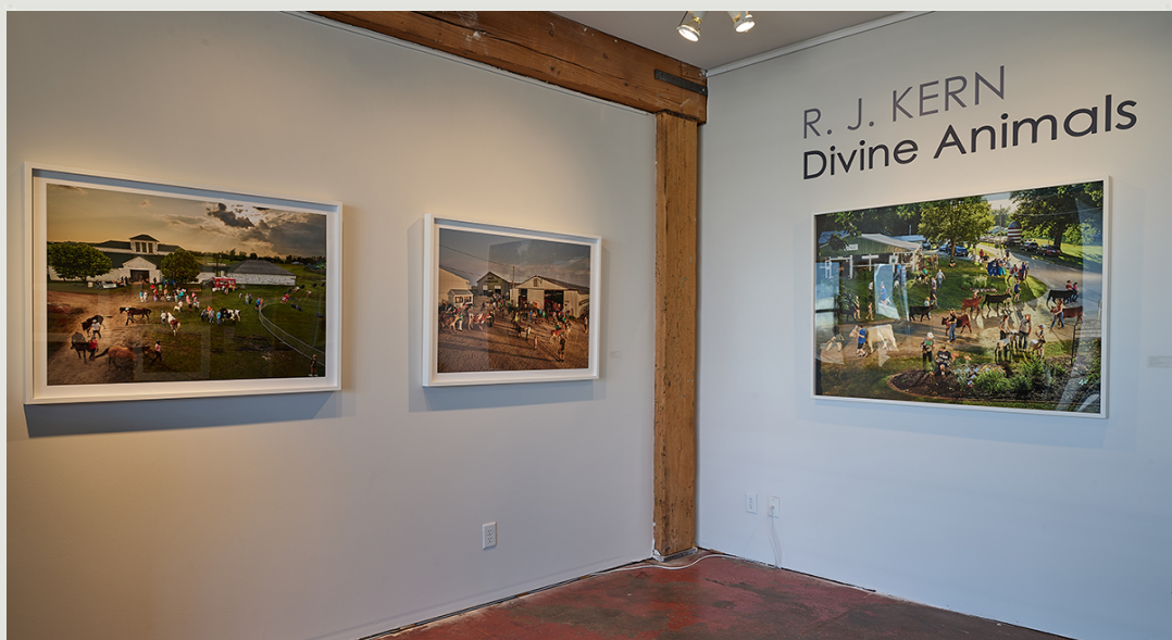
Solo Exhibition, Veronique Wantz Gallery, Minneapolis, Minnesota (2024)