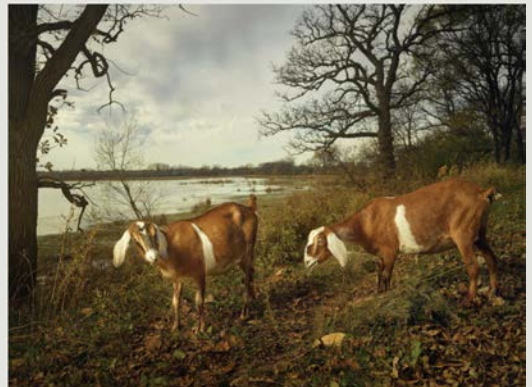
Dumb and Dumber Freeborn County, Minnesota, USA (2016)