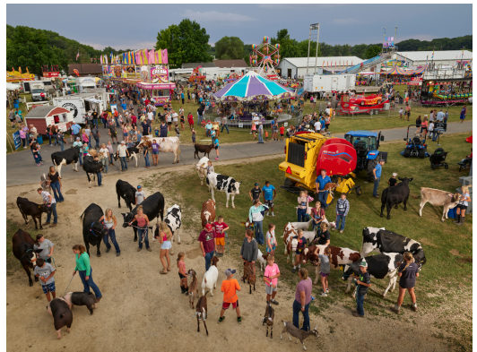
County Fair King and Queen, Winona County (2023)