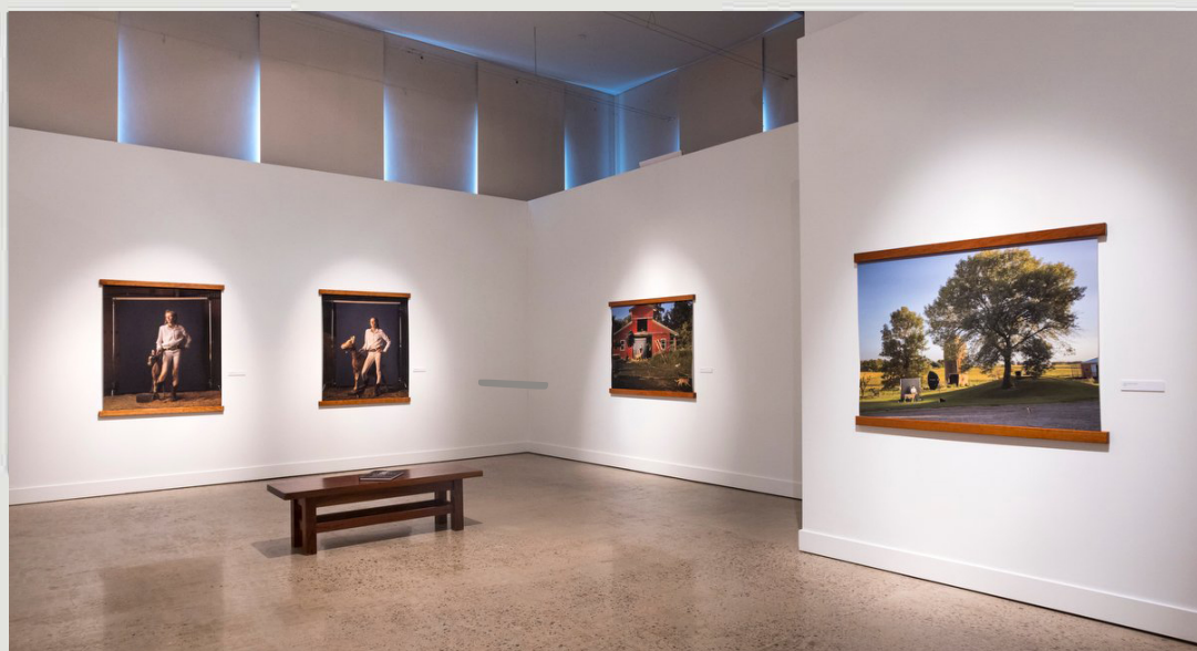
The Unchosen Ones touring exhibition, Oklahoma State University Museum of Art, Stillwater, Oklahoma (2023)