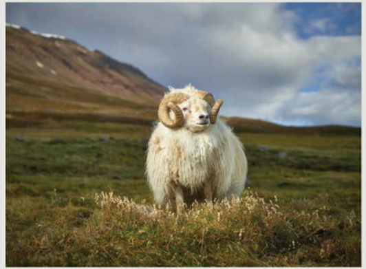
Mr. Hofsós, Skagafjardarsýsla, Iceland (2014)