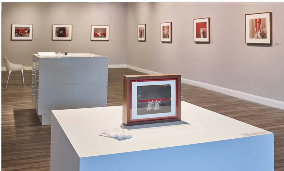
Solo Exhibition, Burnet Fine Art & Advisory, Wayzata, Minnesota (2019)