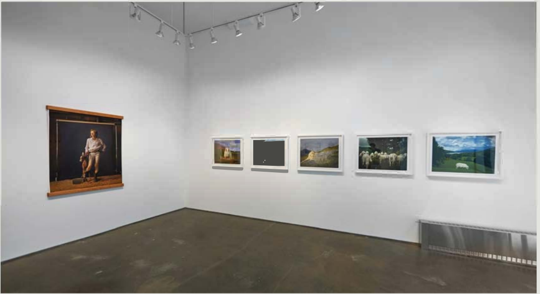
Solo Exhibition, Klompching Gallery, Brooklyn, New York (2018)