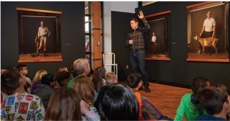
The Unchosen Ones , Solo Exhibition, Plains Art Museum, Fargo, North Dakota (2019-2020)

SELECTED COLLECTIONS holding his work include: Center for Creative Photography (Tucson, AZ), Center for Photography at Woodstock (Woodstock, NY), Fidelity Corporate Art Collection (Boston, MA), General Mills Corporate Collection (Minneapolis, MN), Griffin Museum of Photography (Winchester, MA), Leepa-Rattner Museum of Art (Tarpon Springs, FL), Masur Museum of Art (Monroe, LA), Minneapolis Institute of Art (Minneapolis, MN), Minnesota Historical Society (St. Paul, MN), Museum of Fine Arts (Houston, TX), Museum of Fine Arts (St. Petersburg, FL), Nevada Museum of Art (Reno, NV), North Dakota Museum of Art (Grand Forks, ND), Plains Art Museum (Fargo, ND), and Rourke Art Museum (Moorhead, MN).