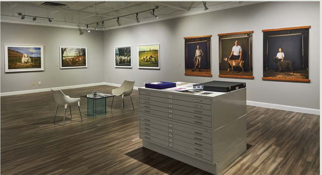
Solo Exhibition, Burnet Fine Art & Advisory, Wayzata, Minnesota (2018)