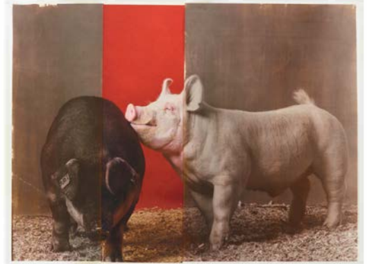
Supreme Champion Swine Male/Female Pair Salt over pigment print, 20 x 24 inches (2019)