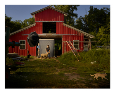
DAVID Pastoral Study, 2020