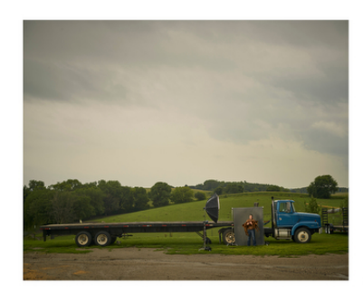
ERIC Pastoral Study, 2020