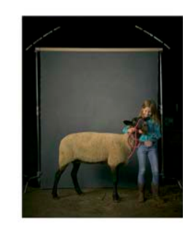
RYLEE AND NELLY CLAY COUNTY MINNESOTA, 2020