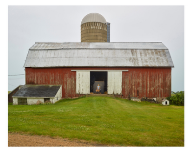
HANNAH Pastoral Study, 2020