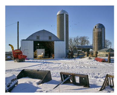
JOSILIN Pastoral Study, 2020